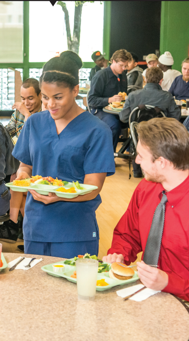
enjoy lunch with friends. The cafeteria has plenty of choices, including healthy options like a salad bar.