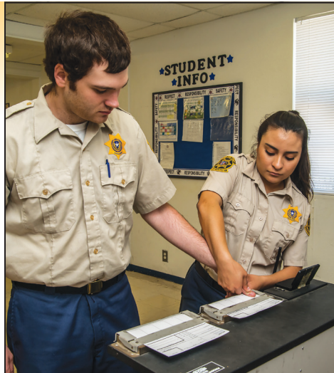
Job Corps students train in high-growth industry sectors, where they can earn industry-recognized credentials.